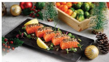
Charcoal-grilled Norwegian Salmon with Black Pepper and Dill 炭燒黑椒香草挪威三文魚