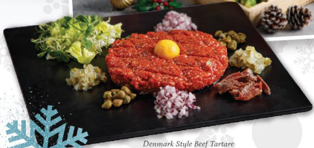
Denmark Style Beef Tartare 丹麥「魔鬼太陽」牛肉韃